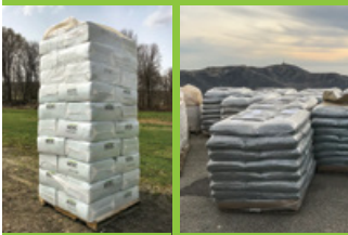
Standard hydromulch pallet 96" H

Shorter pallet height – easy to transport, ability to load full 1 ton pallet on top of hydro-seeder without unpacking.